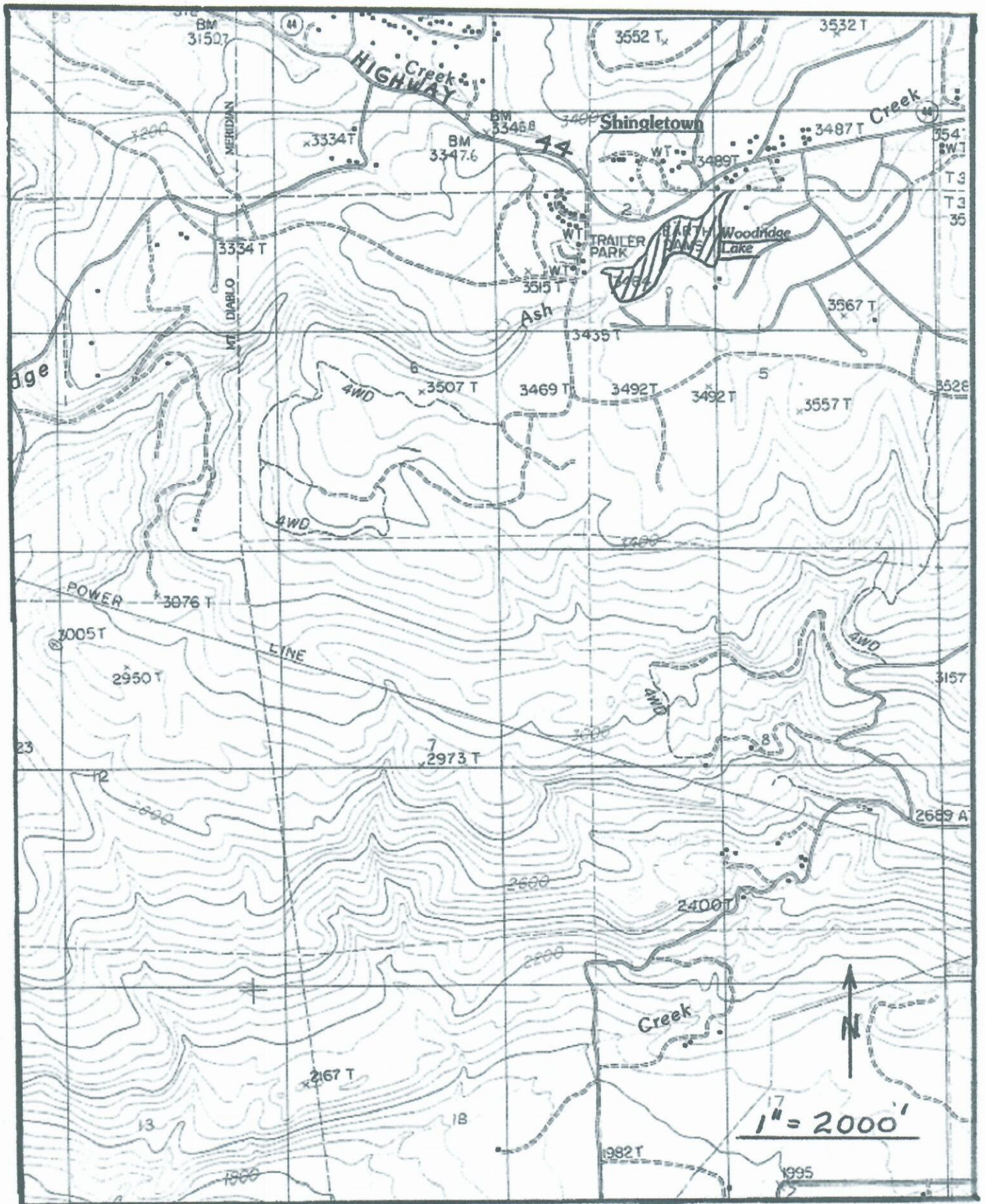
FIGURE 1. WOODRIDGE LAKE LOCATION MAP